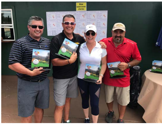
2018 ACNM Golf Classic is May 21st at Albuquerque Country Club.