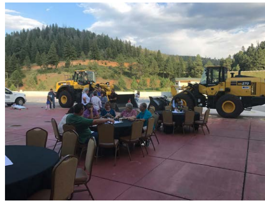
State Convention in Durango, Colorado is July 26th-29th.

Expect more information on these events to come.